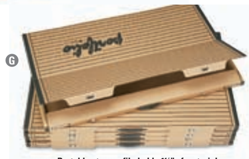
Portable storage file holds 1 1/8" of material