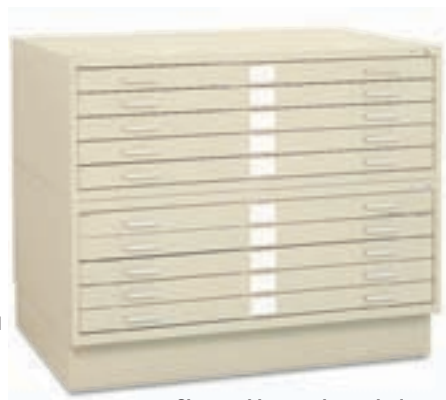
Shown with two units stacked, optional base and locks