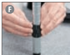
Shelf Lock Clip