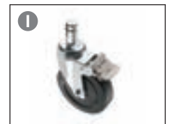
Optional Casters 2,400 lbs. capacity if using casters.