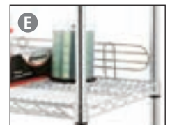
Wall Saver Back Support Prevents item from falling off.