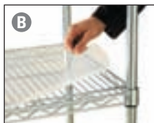
Shelf Liners Prevents small items from falling through.

Optional add-ons create unique storage solutions.