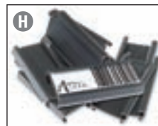
Shelf Tags Snaps on; includes paper labels.