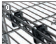
Shelf Connecting Hooks Use to secure additional shelves together.