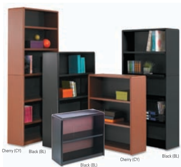
Cherry (CY) Black (BL)