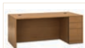
For 10500 Series Laminate Desking and components, see pages 30-35.