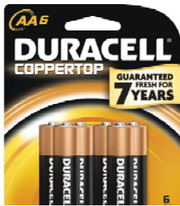
Representative Product Image/ Packaging

The battery products referenced in this PSDS document are consumer products. Under OSHA regulations, batteries are considered “articles” and are not subject to the OSHA Hazard Communication Standard MSDS/SDS requirements which apply for “hazardous chemicals in the workplace.” Additionally, batteries are considered “articles” under the Global Harmonized System and are exempted from the GHS labeling and SDS classification criteria. This PSDS document is provided as service in response to requests for information on battery use, safety and regulatory compliance.